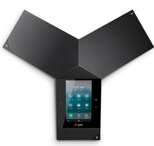
Poly Trio 8300 Conference Phone