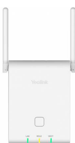
DECT IP Multi-Cell Base Station W90B