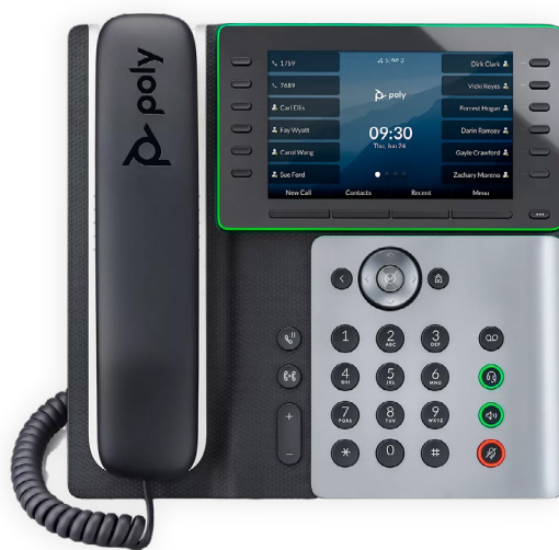
Poly Edge E500