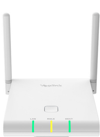
DECT IP Multi-Cell Base Station W90DM