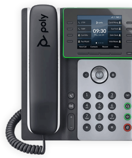
Poly Edge E320