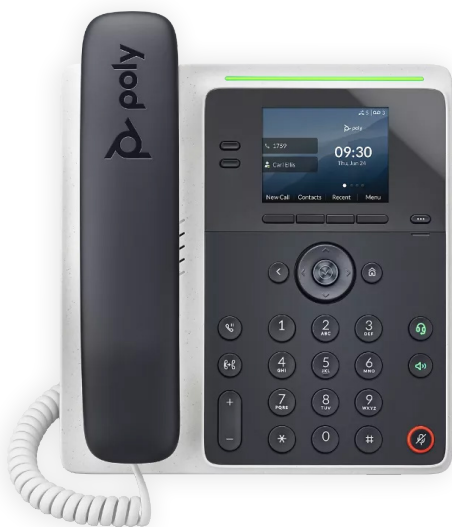
Poly Edge E100